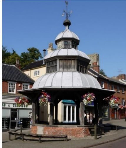
Market Cross, Market Place