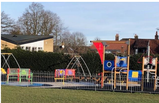
War Memorial Park, Yarmouth Rd