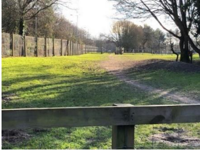
Dog Park, Trackside

Agreed by the Council at its meeting held on 11.5.21