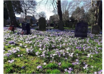
Chapel Cemetery, Mundesley Rd